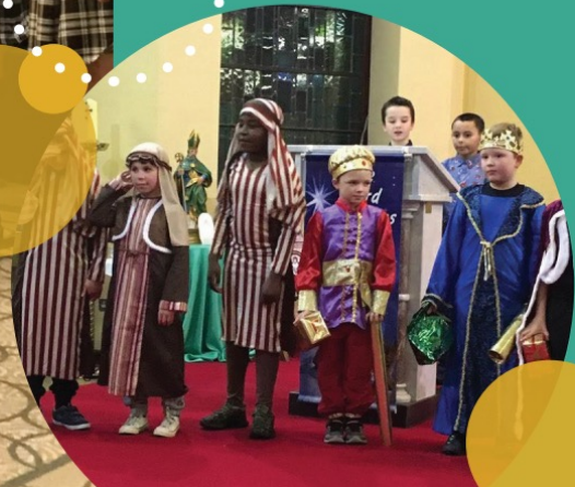
An Edmund Rice School